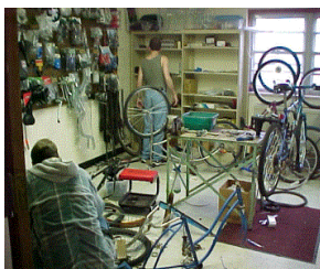
In-stock parts room.