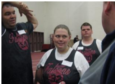
Our Falcon Basketball Team