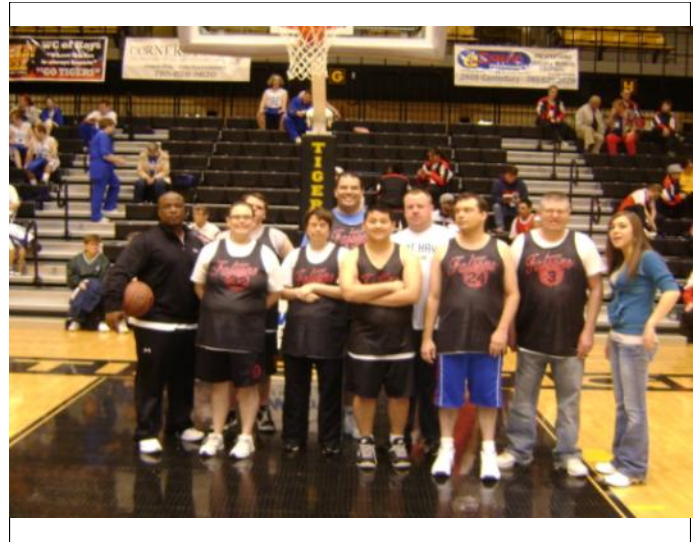
PSH&TC State Basketball Team